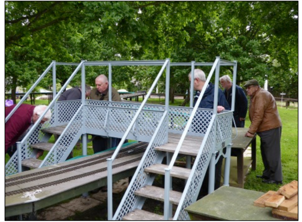
That's it lads we are there. The new bridge installed.

The new steel overbridge, which has stood next to the track since its acquisition and will have been seen by members visiting Colney Heath has been rubbed down and repainted. The problem of installing the bridge over the tracks has been taxing our members' minds, many suggestions were put forward, some sensible others bizarre.